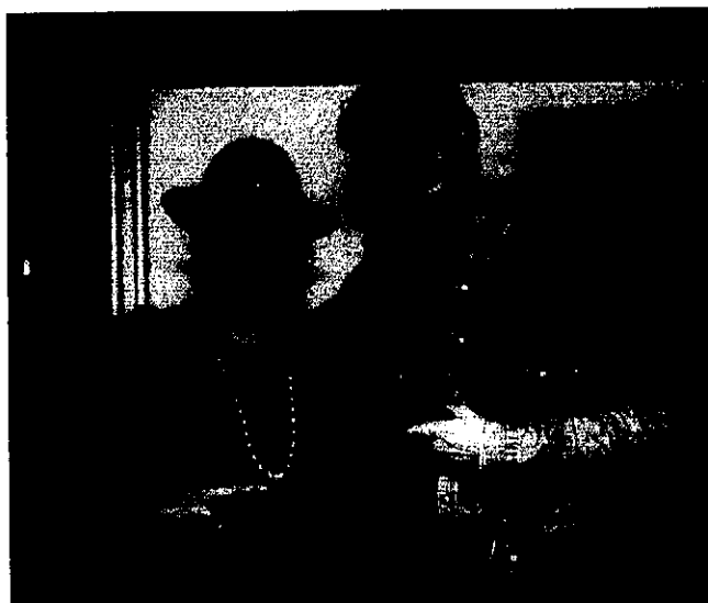
Dr. John and the author

New York, January 28, 2000 Mac Rebennack